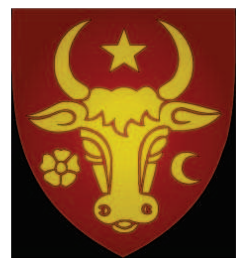
Figure 2. The coat of arms of Moldavia.

In our country, this species disappeared, at the end of the 18<sup>th</sup> century or, maybe, the beginning of the 19<sup>th</sup> century; the areas inhabited by the bison were: Calimani Mountains, Bargaului Mountains and the Eastern part of Maramures.