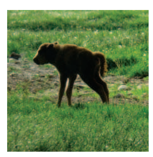
Figure 4. New born female in Vama Buzulaui reserve.

Based on the IUCN strategy for European bison (Status Survey and Conservation Action Plan) it is necessary to set up new reserves, where the surplus bison from the Zoos or other reserves should be acclimatized, becoming available for developing reintroduction programs. The location of bison reserve in Vama Buzaului is ideal to fully exploit the high potential represented by the Romanian Carpathians. In a result we will obtain