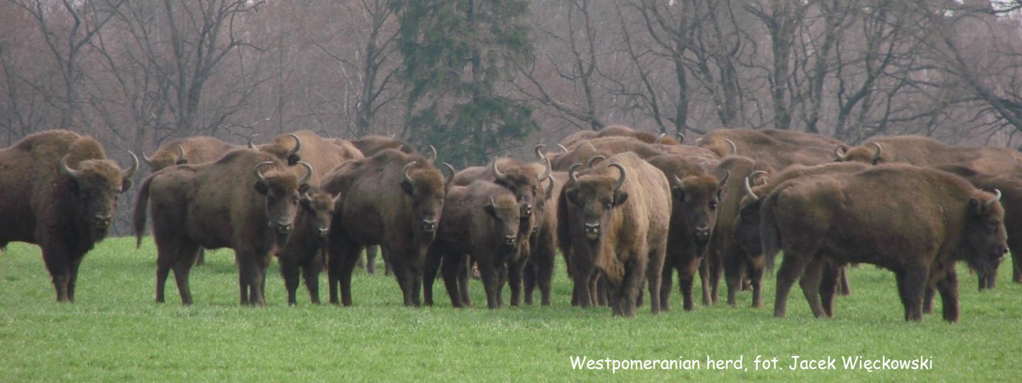
Westpomeranian herd, fot. Jacek Więckowski